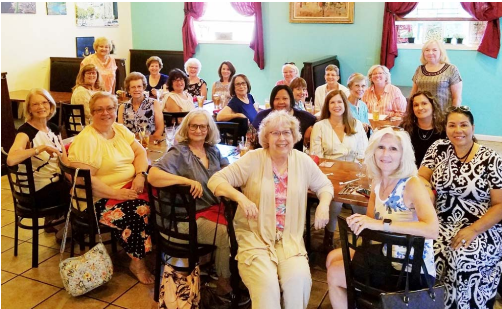
END-OF-THE-YEAR LUNCHEON: Twenty-four members enjoyed getting together for a social time and a delicious luncheon at Kitchen 519 in Glendora.