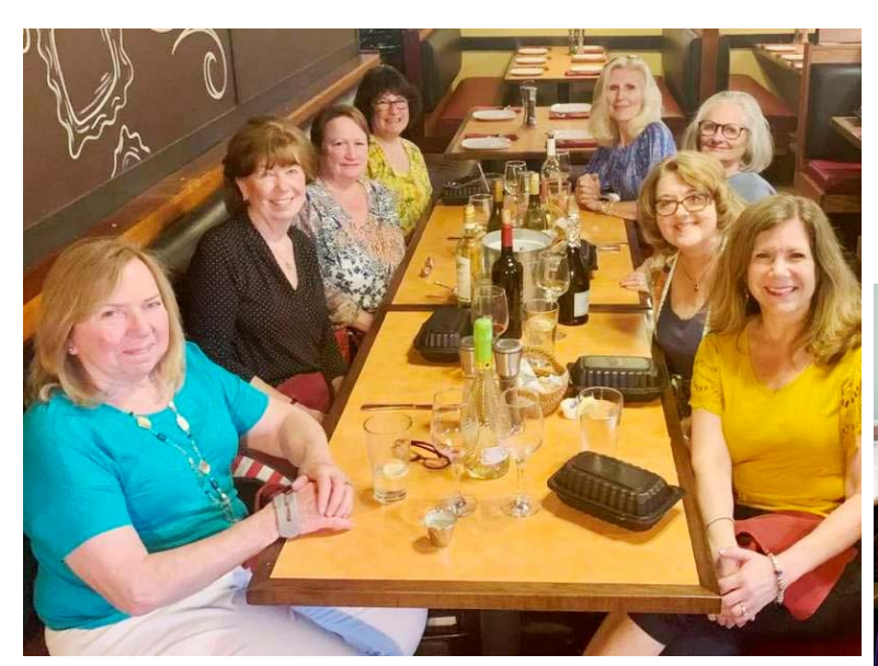
EXECUTIVE BOARD DINNER: The Board went out in June to celebrate the end of the club year. Many thanks to these ladies for all the work that goes into serving on the Board! Their leadership is what makes our club so great!