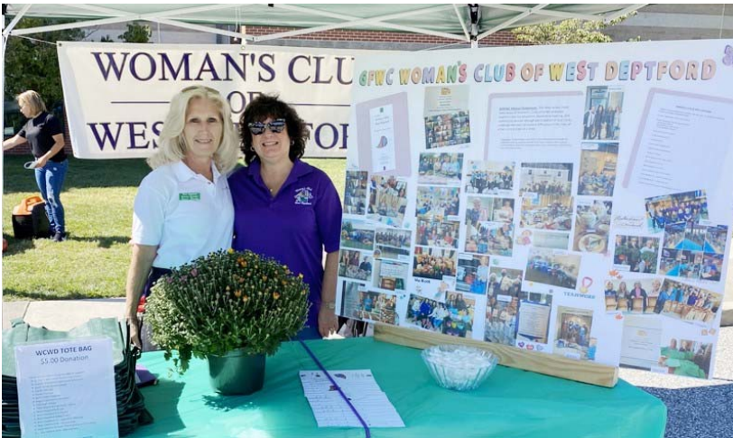
WEST DEPTFORD FAMILY FUN DAY (left) was a fun and productive time for our club. Thanks to all that helped staff our booth and talked up the club to the women of West Deptford.