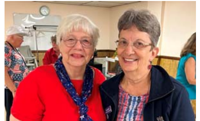
RED, WHITE, AND BLUE was the theme of our September meeting to celebrate Patriot Day.