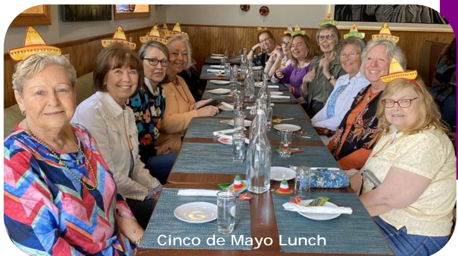
Cinco de Mayo Lunch