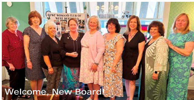
Welcome, New Board!

Welcome Back! We hope everyone had a wonderful summer and are ready to join in our fall activities.