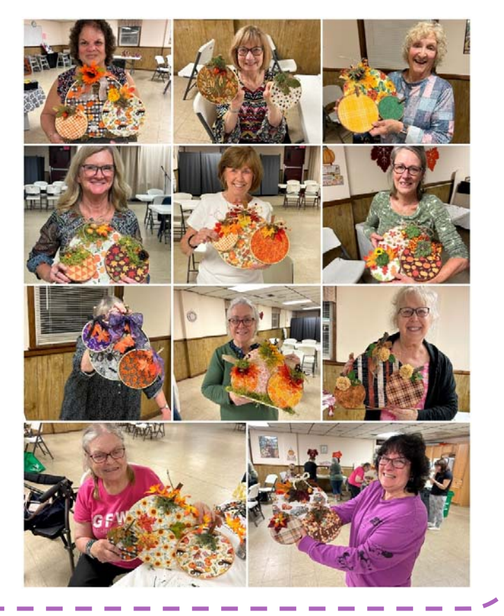
The arts are... a very human way of making life more bearable. Practicing an art, no matter how well or badly, is a way to make your soul grow....