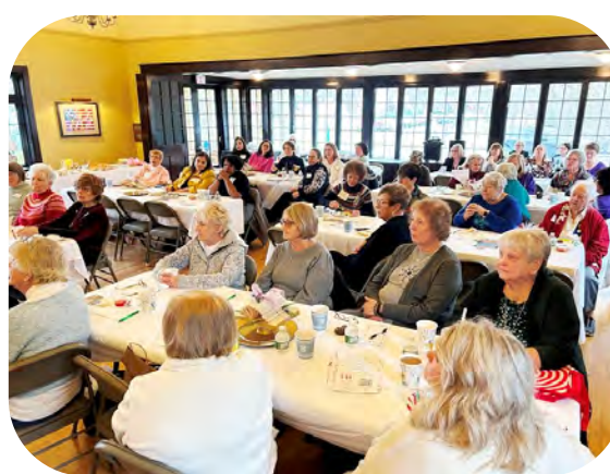
DISTRICT COUNCIL at the Porch Club of Riverton, Jan. 2025