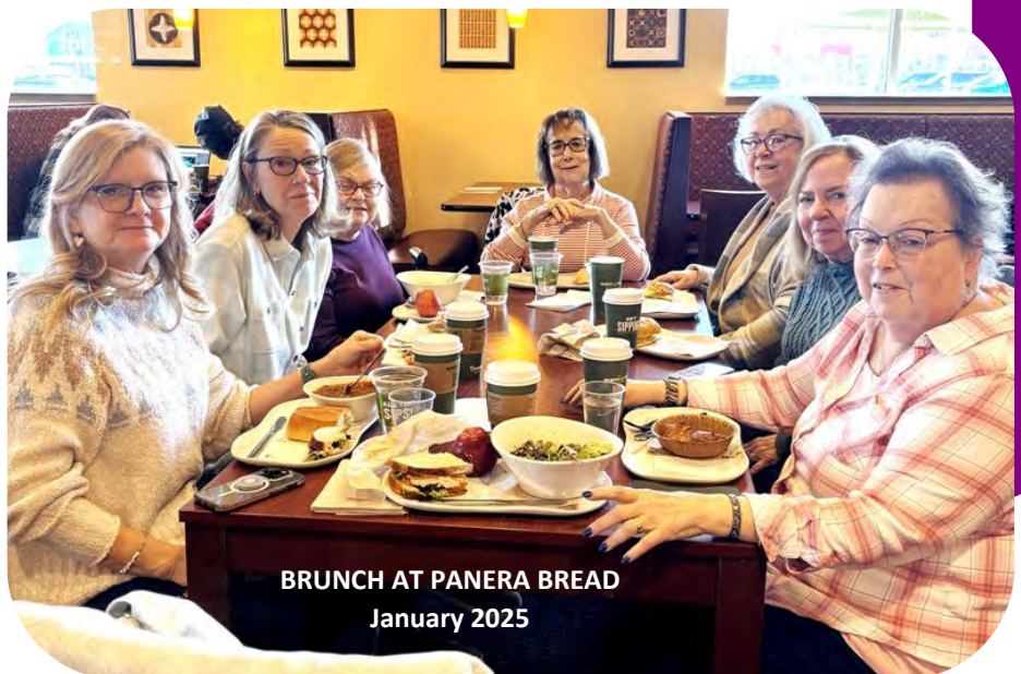
BRUNCH AT PANERA BREAD January 2025