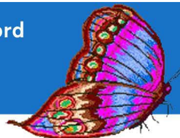
Woman's Club of West Deptford

GFWC Woman's Club of West Deptford in Partnership with The NJ Children's Alliance