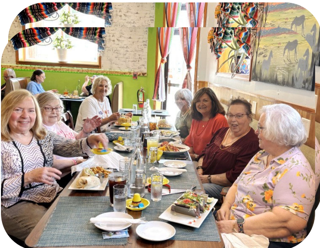
CINCO DE MAYO LUNCHEON at La Tentacion. Our group had a great time and enjoyed delicious Mexican food!