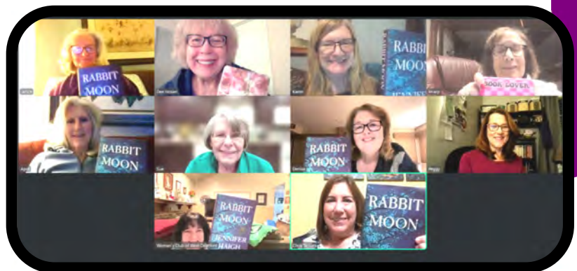
JANUARY BOOK CLUB

Thank you for your cooperation. It is much appreciated.