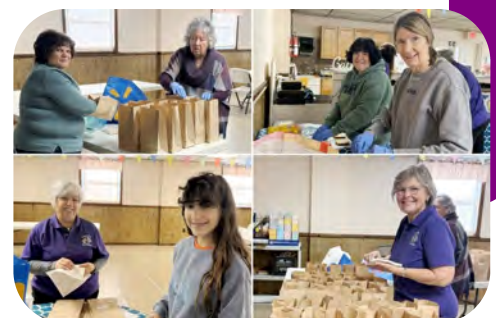
DAY OF SERVICE