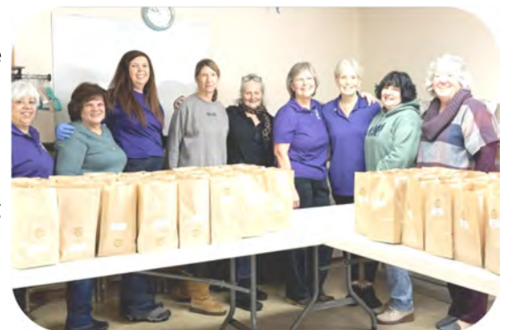
DAY OF SERVICE, January 19, 2026