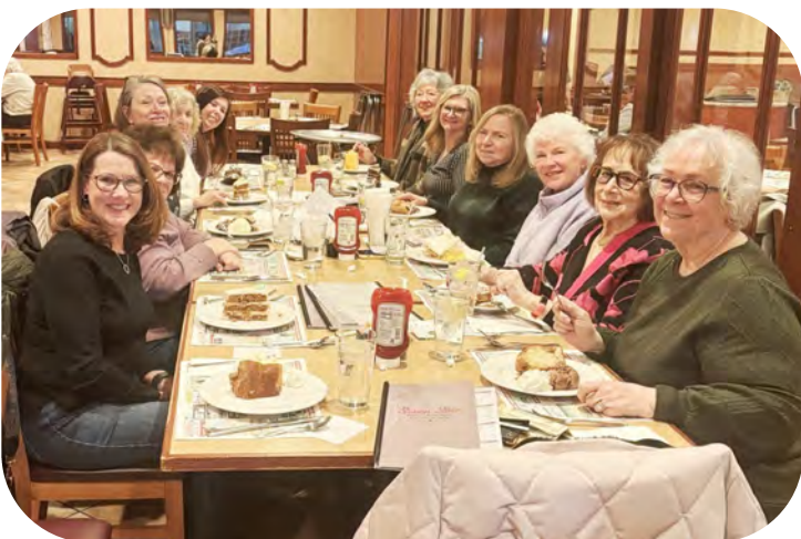
DESSERT NIGHT AT SEVEN STAR

Being a pop-up, there is NO NEED TO RESPOND . If the weather is good and you are available, we'd love to have you join the social committee for a brunch. As always you are responsible for your own meal. If necessary, we will try to push as many tables together as needed to meet our needs. Hope to see you there.