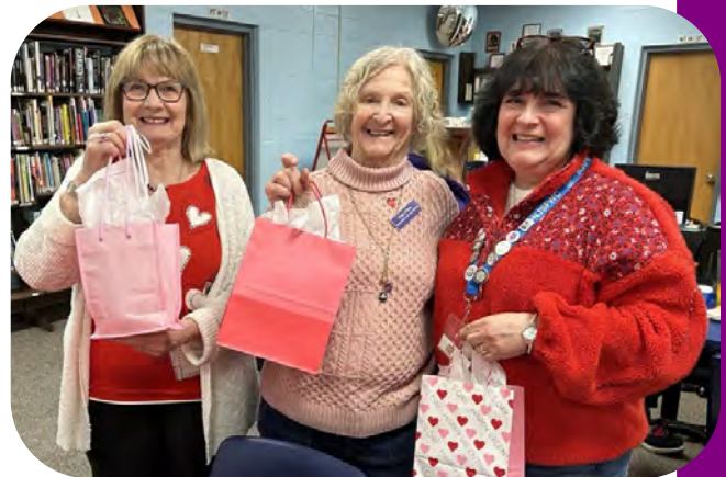
GALENTINE'S DAY CELEBRATION

** TUESDAY, June 2, 2026 Phillies Game: 6:40pm TWO TICKETS LEFT to keep our cost at $45.50