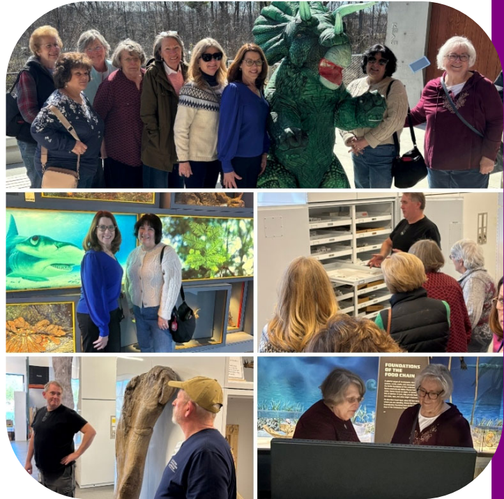
Our club joined with the Gloucester County Woman's Club on a group trip to the Edelman Fossil Museum of Rowan University. We had an enjoyable afternoon discovering "Creatures from the Cretaceous" and learning about fossils and the natural history of our planet and area.