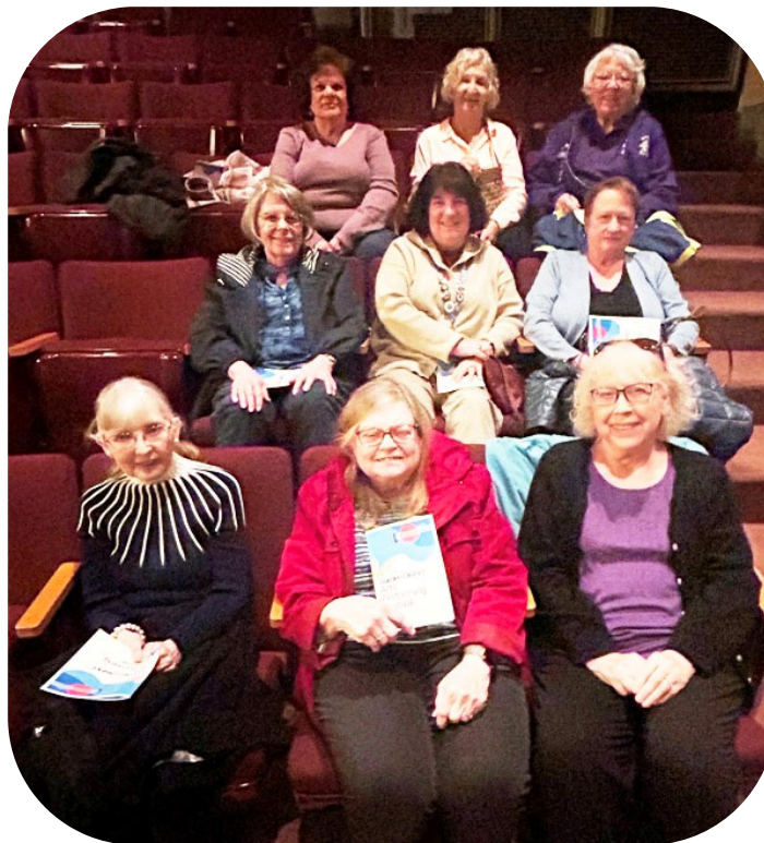
GARDEN DISTRICT ARTS PERFORMING: Nine of our members made the trek down to Salem Community College in Carney's Point to view the talented performances of club members from all over our District. It was a fun time, and we especially enjoyed dancing by the Merchantville Tappers and a funny skit, "You're Never Too Old to Be a Calendar Girl," by the Women's League of Mount Holly.

As a reminder, our third and final collection will take place at the April meeting. Members can bring money or gift cards to Wawa, and this month we are collecting overnight menstrual supplies. Thank you for continuing to support this effort and helping us make a difference together.